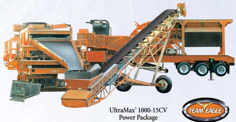
UltraMax® 1000-15CV Power Package